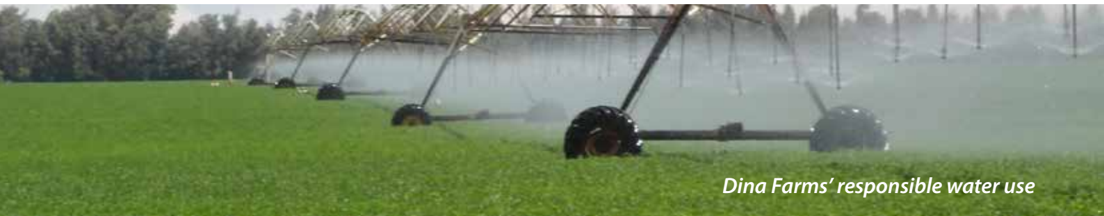
Dina Farms' responsible water use